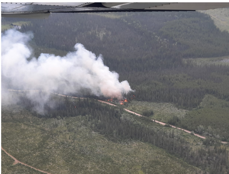
Photo: Pinkut Creek Fire on June 30th, 2021.